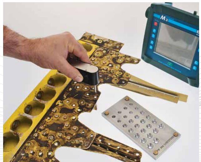
Bore hole inspection with mini rotor on aluminium structures