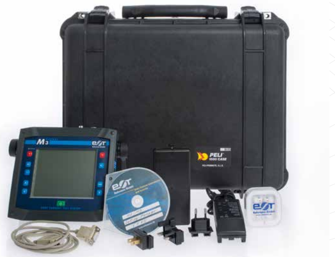
ELOTEST M3 Set