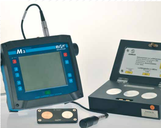
Conductivity measurement in IACS or MS/m from 1 % up to 110% IACS