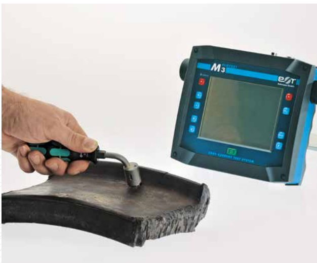
Test set for rough environmental conditions with LED-crack indicator on the probe