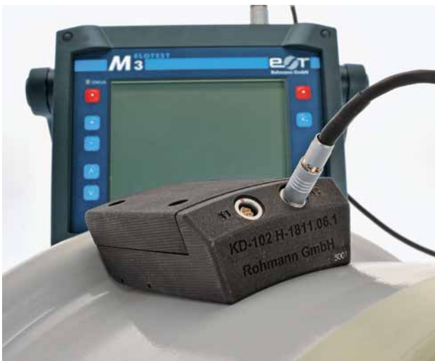
Manual surface crack detection with adapted contour sensor