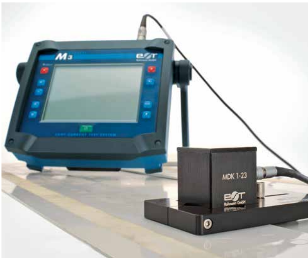
Crack detection of hidden defects in aluminium rivet layers