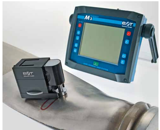
Dynamic surface crack detection rotor blade